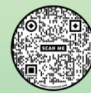
Buy 2024 HR-V Sport raffle ticket here.